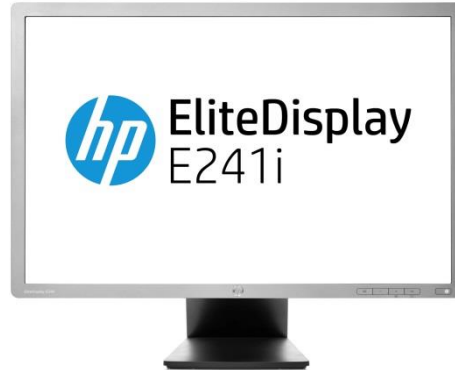
HP EliteDisplay E241i 24-inch IPS LED Backlit Monitor

IPS goes mainstream with the HP EliteDisplay E241i 24-inch IPS LED Backlit Monitor, a business-class combination of a large screen, extra-wide viewing angles, and extraordinary comfort.