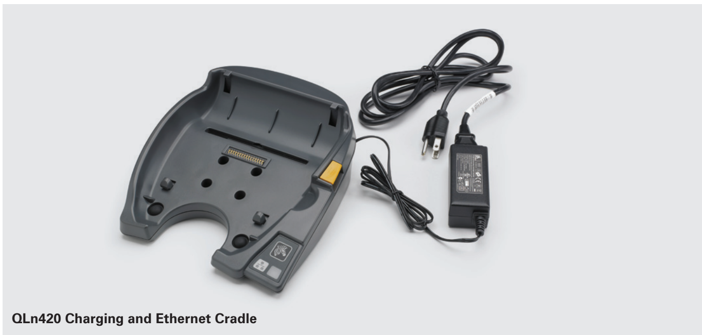
QLn420 Charging and Ethernet Cradle