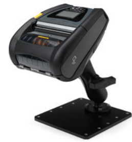
Plate and RAM mount arm permits compact and fixed mounting to a forklift.